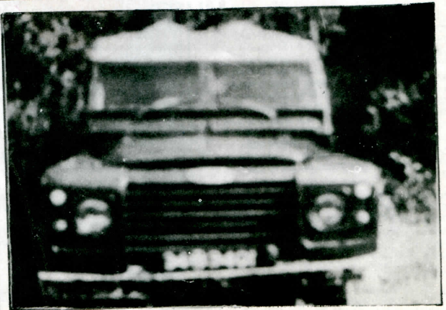
Armoured Personnel Carrier (APC) captured by TELO Army from Gurunagar Camp

— THANGATHURAI, Father of the Nation Tamil Eelam