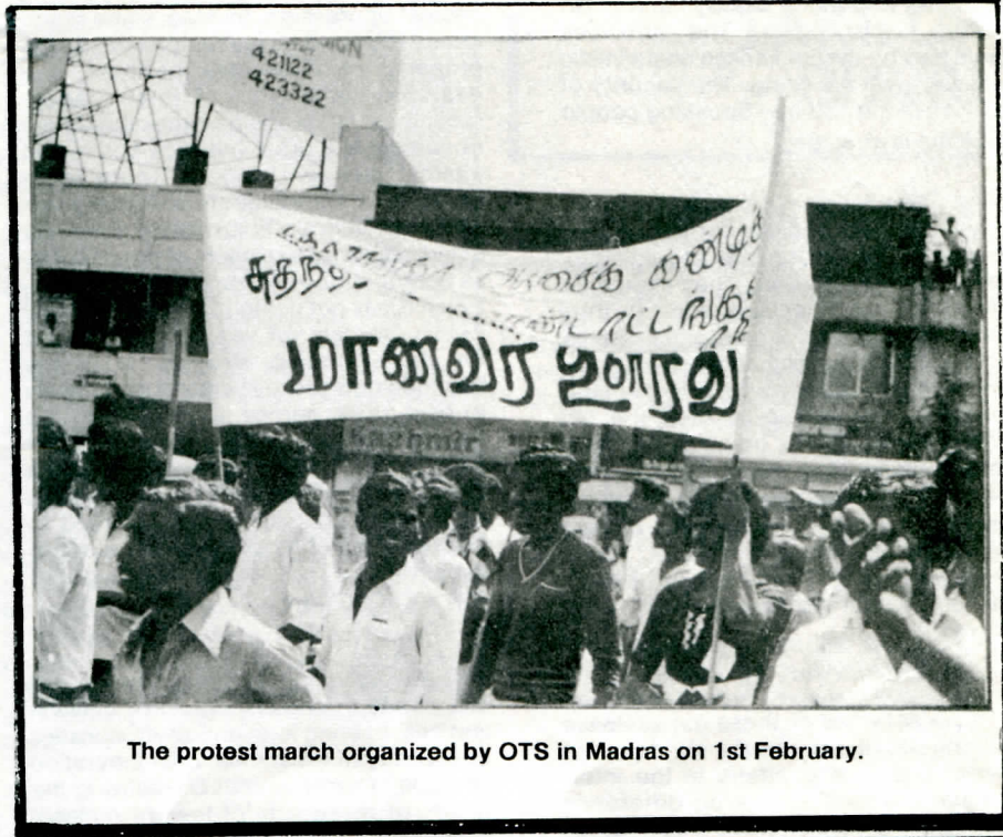
The protest march organized by OTS in Madras on 1st February.

In April 1984, the EROS , EPRLF and the TELO formed a united front. It is now called the Eelam National Liberation front ( ENLF ). Today, negotiations are in progress for the other major groups to join the ENLF . The OTS believe that with the co-ordinate plans formulated by the ENLF , it will be only a matter of time for the armed forces of the Sri Lanka government to retreat from our territory. It will not take long for the Sri Lankan State Machinery in our territory to collapse. The organisation of Tamil Students will put its heart and soul to make the co-ordination produce meaningful results. Further more, its monthly magazine would strive to enlist international support for the Eelam Cause.