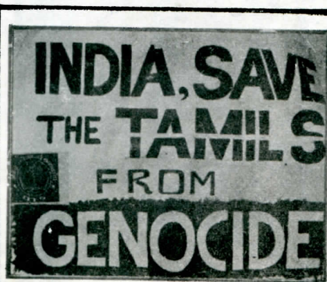
One of the slogans carried by the students during the protest march

The OTS will continue its struggle in support of the Tamil Eelam struggle.