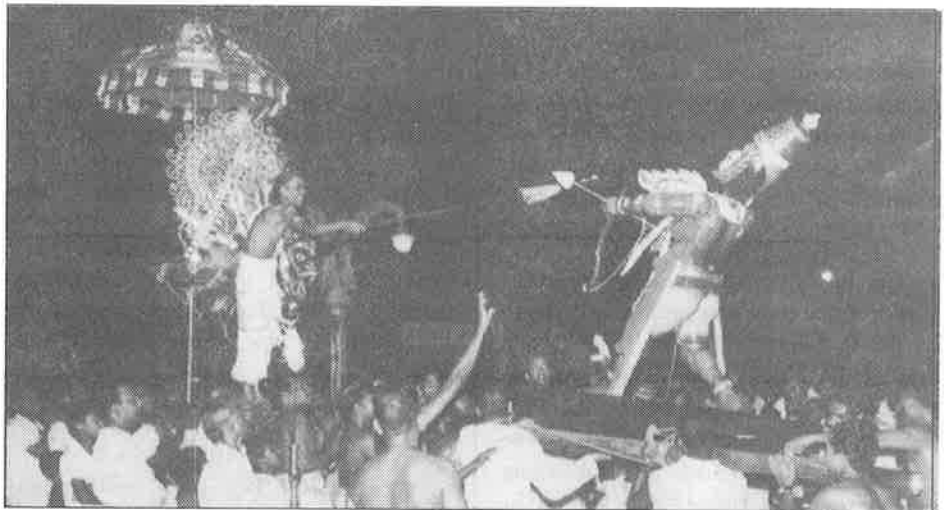
Sura Sankaram festival at a Colombo temple.

Have the ancients ensured remembrance of valorous deeds by associating them with religious significances?