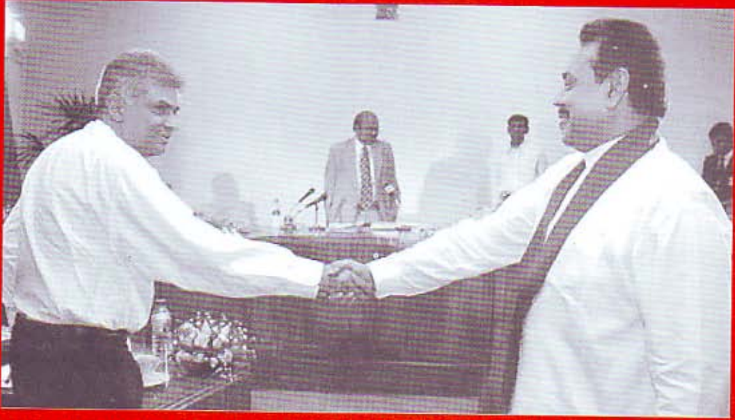
UNP leader Ranil Wickremasinghe and Prime Minister Mahinda Rajapakse shake hands after nominations – Election Commissioner Dayananda Dissanayake in the centre; (below) the rival candidates seemingly seeking divine assistance

Vol XXIV No 10 ISSN 0266 - 4488 OCTOBER 2005 90p