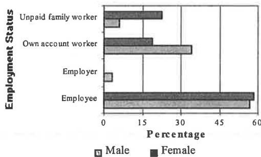
Figure 1: Employed persons by employment status & sex