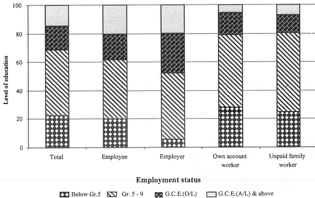
Figure 3 – Distribution of employed persons by level of education & employment status

◆ The proportion who have attained a level of education G.C.E.(A/L) & above is reported to be lowest among own account workers and highest among employees.