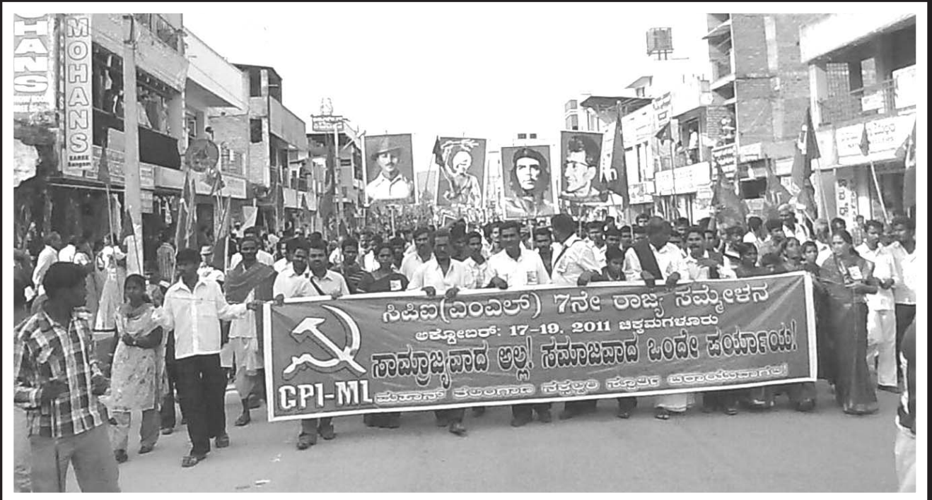
Seventh Karnataka State Conference Rally

No To Reformism, No To Anarchism March Towards People's Democratic Revolution Make Ninth Congress of CPI(ML) a Great Success