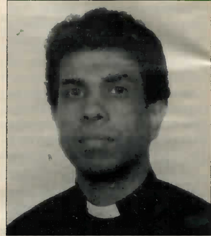
Our strength is working together, our love is uniting together, our goal is achieving together".

"As new life and new hope came into the disheartened followers of Jesus on the first Easter morn, a newness of life and hope can come upon us too which gives us resurrection strength to achieve our goal.