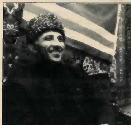
Chechnya's ruler Aslan Maskhadov