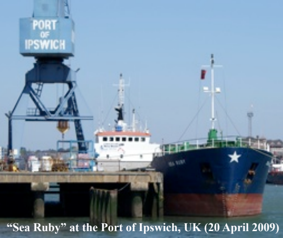
"Sea Ruby" at the Port of Ipswich, UK (20 April 2009)

Thousands of first, second and third generation Tamil Diaspora volunteers in France, the United Kingdom, Germany, Canada, Norway, Italy, Sweden, Denmark, Finland, Belgium, Switzerland, the Netherlands, Australia, New Zealand, Malaysia and the United States have worked closely together to conceive, plan and implement this "Mercy Mission to Vanni" (Vanangaman). It is a show of solidarity and concern by the worldwide Tamil Diaspora for their friends, relatives and fellow Tamils in the Vanni.