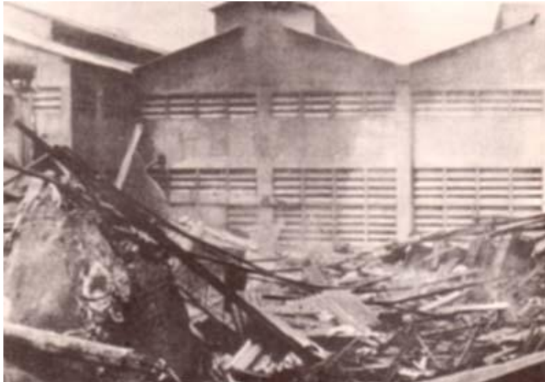
Burnt Shell of World Bank aided Cyntex Mill in Ratmalana

By seven in the evening, I received the news of the attack on the army. All Tamils started phoning each other – expecting the worst, but hoping for the best: At about 1 o'clock, on the morning of Monday, the 25th, I was woken by a telephone call from a Sinhalese friend telling me that Tamil houses in Rosmead Place were burning. It was the start of a nightmare that was to last for days.