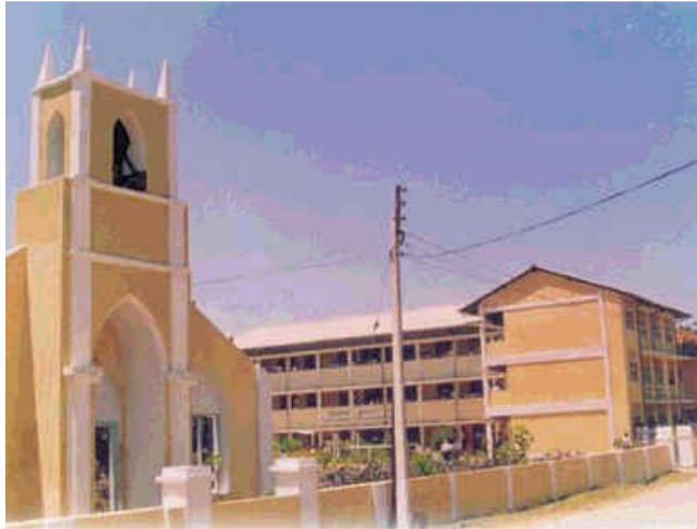
Hartley College, 2004