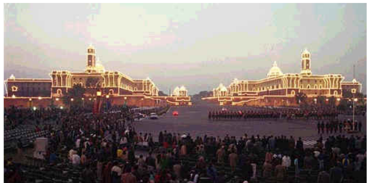
२६ जनवरी २००२ को नई दिल्ली में आयोजित बीटिंग रिट्रीट समारोह के दौरान नार्थ ब्लॉक, साऊथ ब्लॉक और राष्ट्रपति भवन पर की गई रोशनी का दृश्य ।