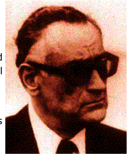
Rameshwar Nath Kao

More serious than these factors, Third Agency's analysts pointed out, would be the influx of forces inimical to India into Sri Lanka. They said,