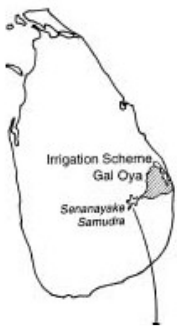
Gal Oya Irrigation Scheme

Prime Minister D. S. Senanayake, who was instrumental in commencing the colonization schemes - the Gal Oya Scheme in Ampara and the Kanthala scheme in Trincomalee district and who disfranchised the Indian Tamils, dismissed the federal