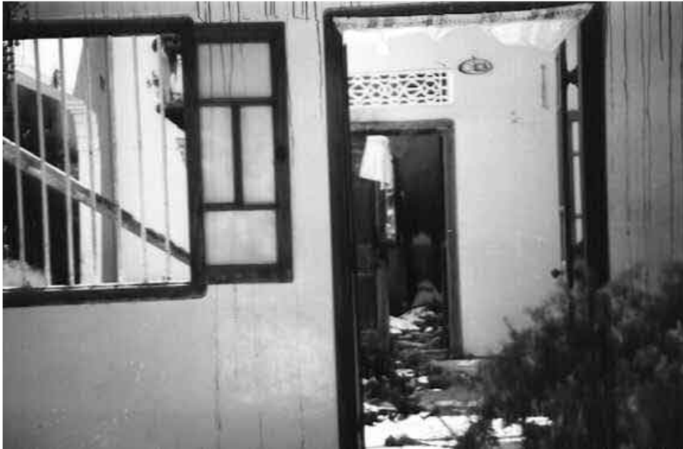
Tamil home destroyed in 1958 pogrom

Tamils as a community, especially the youth, felt slighted by the policies and actions of the Sinhala leaders and the mobs which these leaders unleashed on them. They developed a sense of grievance against the Sinhala rulers. Some of the youths, the most sensitive in the community, started thinking of hitting back.