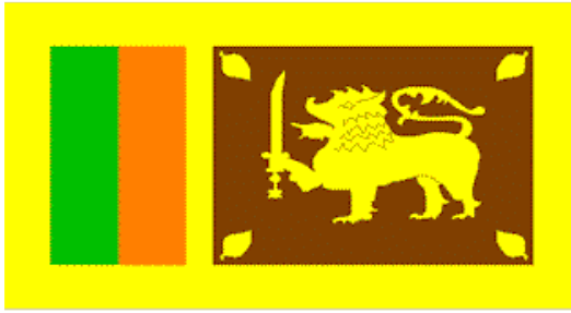
Sri Lanka's lion flag

The years 1954 to 1956 saw this parallel growth of Sinhala and Tamil nationalisms reach their crescendo. Sinhalese and Tamils were proud communities with highly developed ancient civilizations. If both had been accommodated they would have added richness to the fabric of Sri Lankan life.