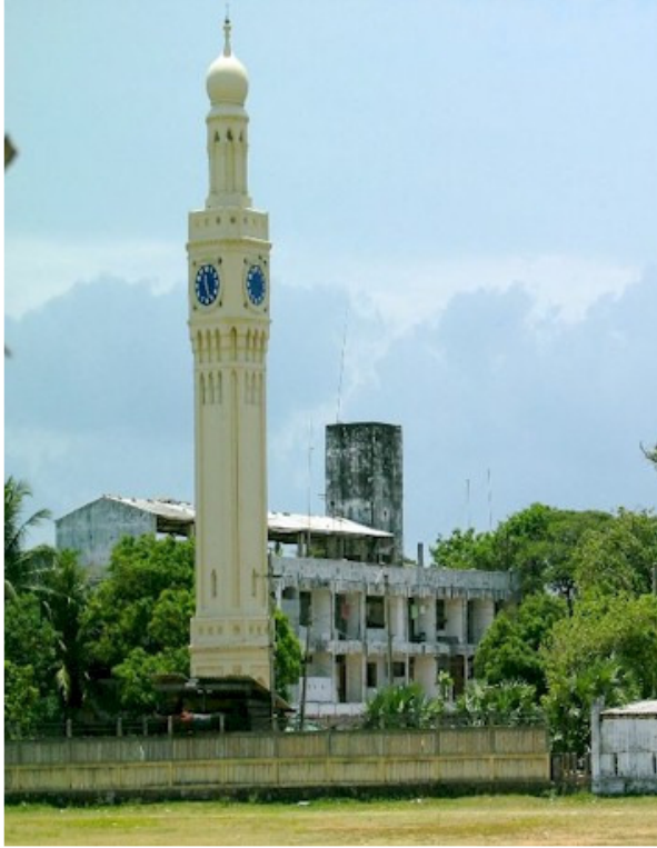
Clock Tower today