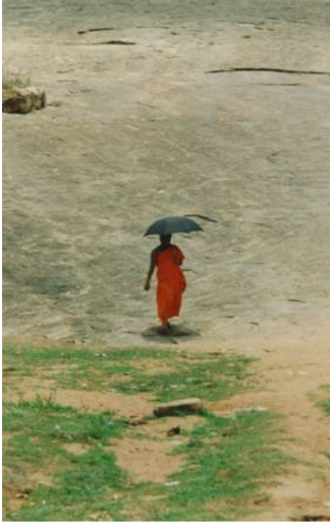
Dambulla Cave Temple