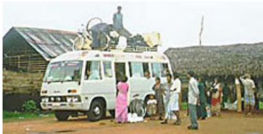
Waiting for a bus

The government reacted to this theft and the attack on the Yal Devi by TELA by restricting trains and other essential services to Jaffna. It even stopped private buses plying from Colombo. At Iratperiyakulam, near the army camp, six private buses plying to Jaffna were smashed up. A bus from Point Pedro to Colombo was fired at by the army and the driver, a Sinhalese, was injured. Defence Ministry planted stories about banning bicycle travel in Jaffna, the main mode of transport in the peninsula.