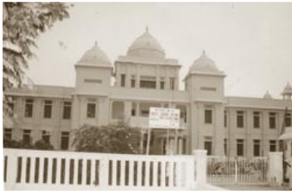
Jaffna Public Library