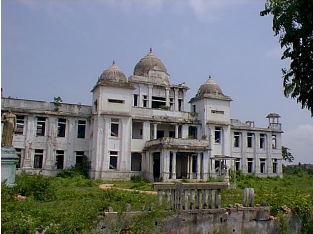
Jaffna Public Library

Jaffna's entire populace was awake that gloomy night watching helplessly the dark smoke that spiraled up and hung low covering the starry blue sky. They stared helplessly because the few who went out to douse the fire were chased back by the police. Some eyes were tearful. Some eyes were closed, unable to bear the sight.