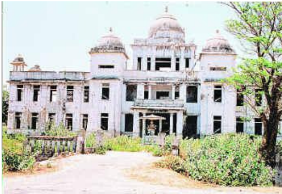
Jaffna Public Library

The TULF General Council met at Vavuniya a week later to consider its stand on the bill. Opening the discussion in that 10-hour meeting Amirthalingam proposed that they support it. "Calling it a historic piece of legislation, Amirthalingam gave