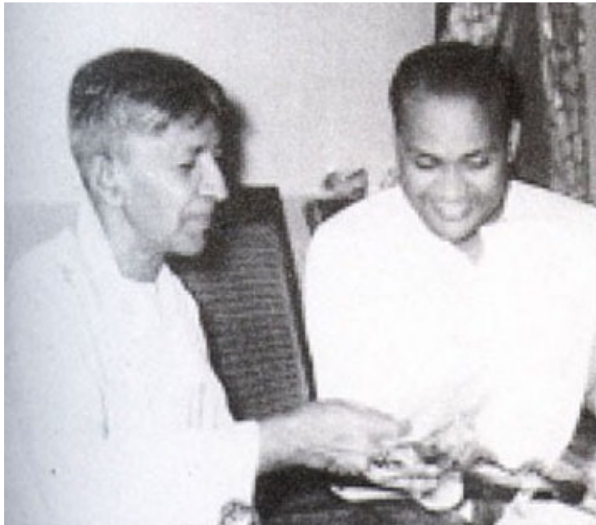
Chelvanayagam and Amirthalingam

Pirapaharan was in Sri Lanka during that time to reconstitute and revitalize his group. He was determined to stage a comeback. He was determined to build a guerrilla group loyal to him, a group that would do his bidding. He had decided that theoretical bickering, disputes about the mode and manner of the struggle and endless squabbling about the running of the organization would not take the freedom struggle forward. He adopted the practical approach adopted by Thanthai Chelva: sole leader, single decision-maker, single-minded commitment to the cause of freedom for the Tamils. Kittu, one of his deputies, in an interview to the LTTE's official journal, Viduthalai Puligal had adverted to this. Pirapaharan had told him that Thanthai Chelva was able to negotiate agreements with prime ministers S. W. R. D. Bandaranaike and Dudley Senanayake because he was the sole leader of the Tamils. If Thanthai Chelva had taken Tamil Congress leader G. G.