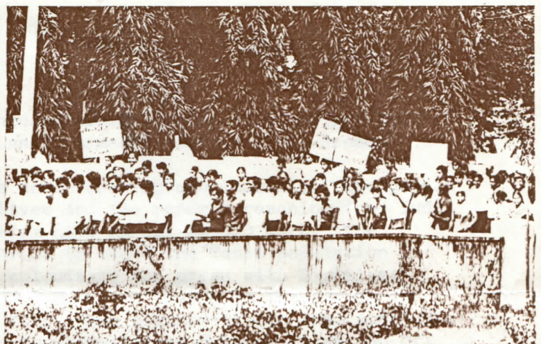
DEMONSTRATION ORGANIZED BY GUES.