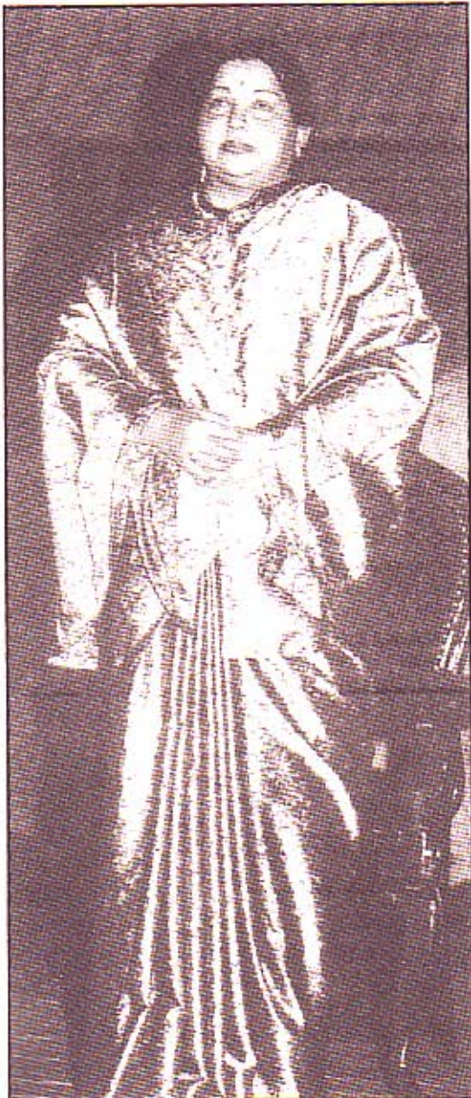
Tamil Nadu Chief Minister, Ms. Jayalalitha Jayaram