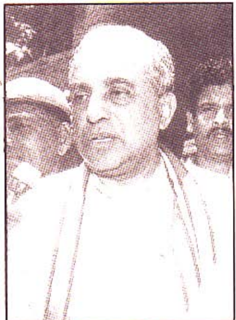
Dr. Subramanian Swamy