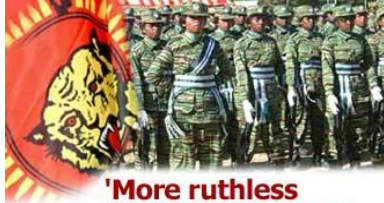
'More ruthless than Prabhakaran'