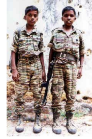
LTTE Child Soldiers

-The LTTE's use of children as front-line troops was proved when 25 front-line troops between the ages of 13 and 17 surrendered en masse to the Sri Lankan Forces. Amid international pressure, LTTE announced in July 2003 that it would stop conscripting child soldiers, but both UNICEF and Human Rights Watch have accused it of renegeing on its promises, and of conscripting Tamil children orphaned by the tsunami. Civilians have also complained that the LTTE is continuing to abduct children, including some in their early teens, for use as soldiers. Moreover UNICEF states that the LTTE has recruited 315 child soldiers between April and December 2006. According to UNICEF, the LTTE is known to be the world's worst perpetrator of child soldier recruitment and has recruited, since 2001, a total number of 5,794 child soldiers.