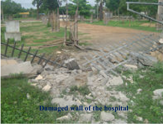
Damaged wall of the hospital