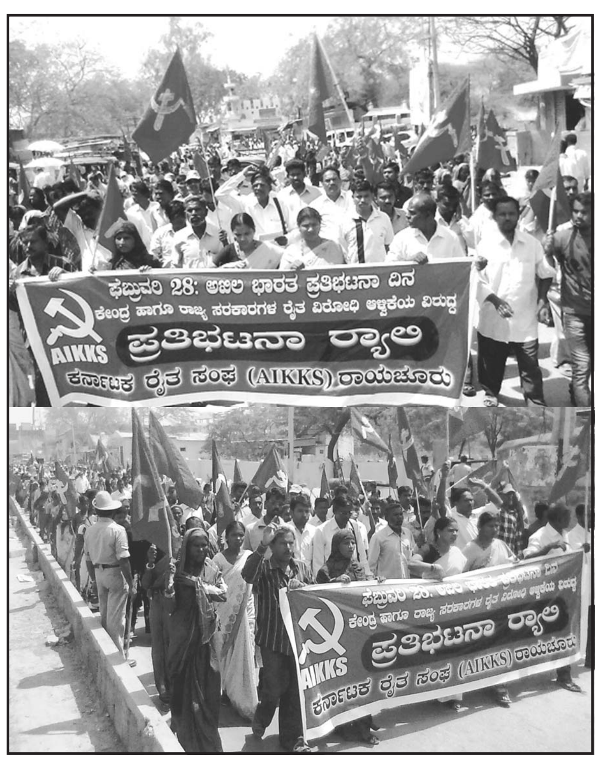
Rally and Demonstration at Raichur, Karnataka on Feb 28 by All India Krantikari Kisan Sabh (AIKKS)

Postal Reg. No. DL(W)-18/2188/2012-14 RNI Registration No. - DELENG/2000/615