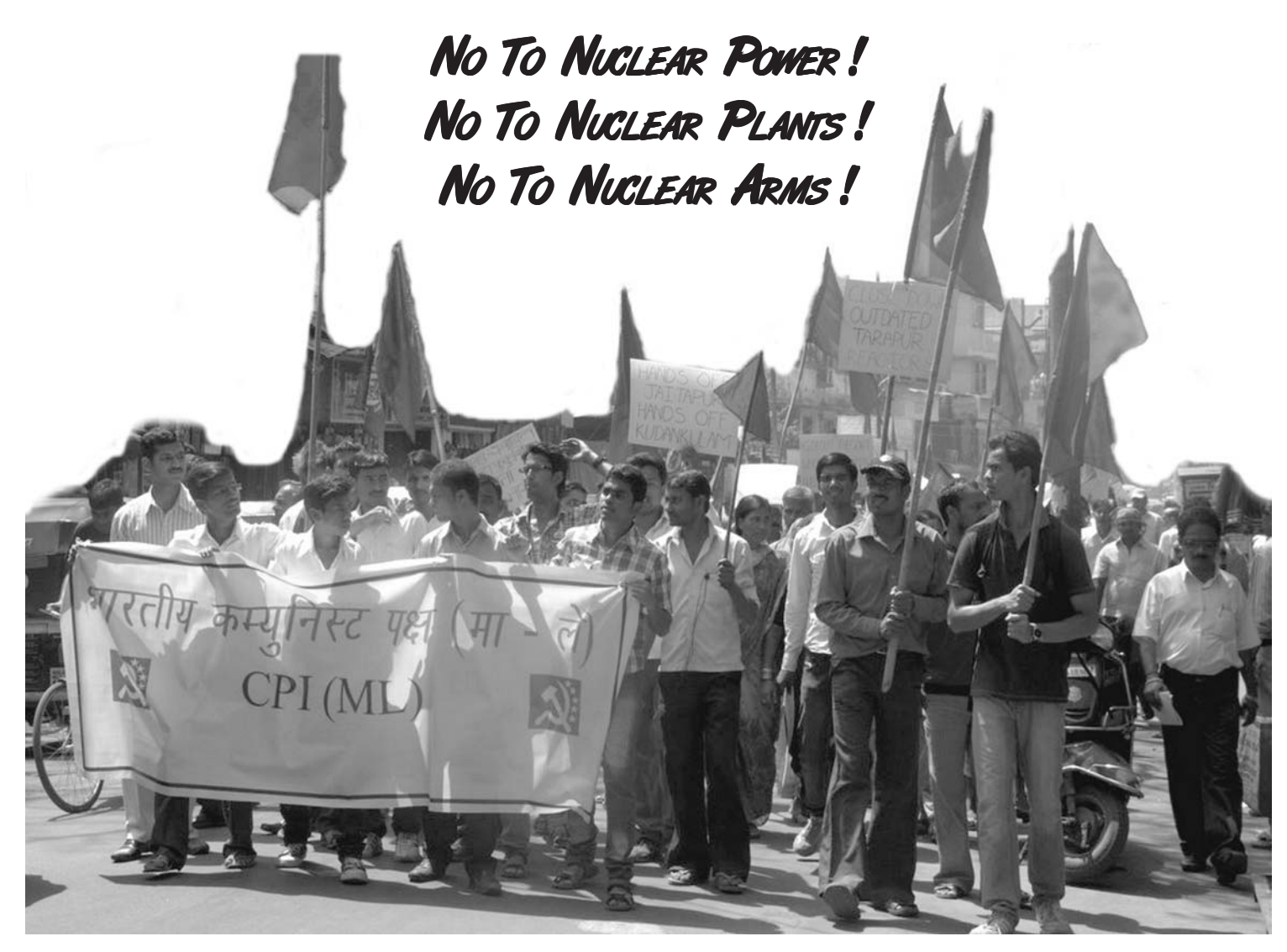
Demonstration at Dombivli, Thane, Maharashtra on March 4, 2012