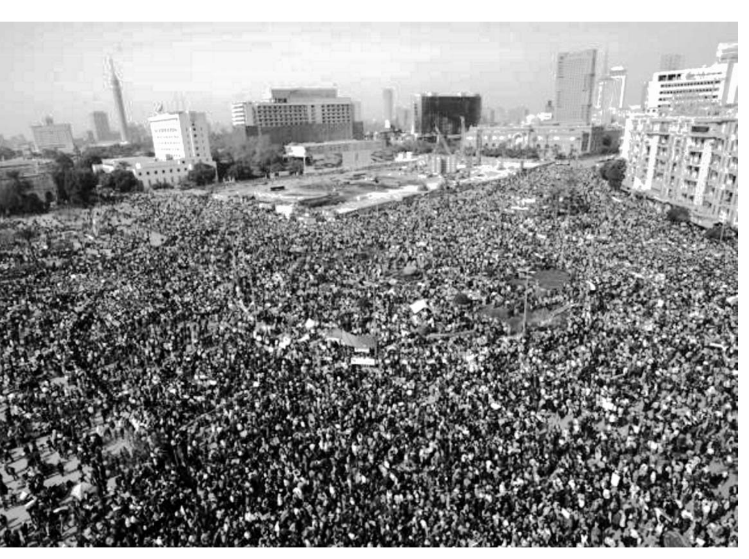
Tahrir Square, Egypt on 11 February, 2011: The Mass Uprising