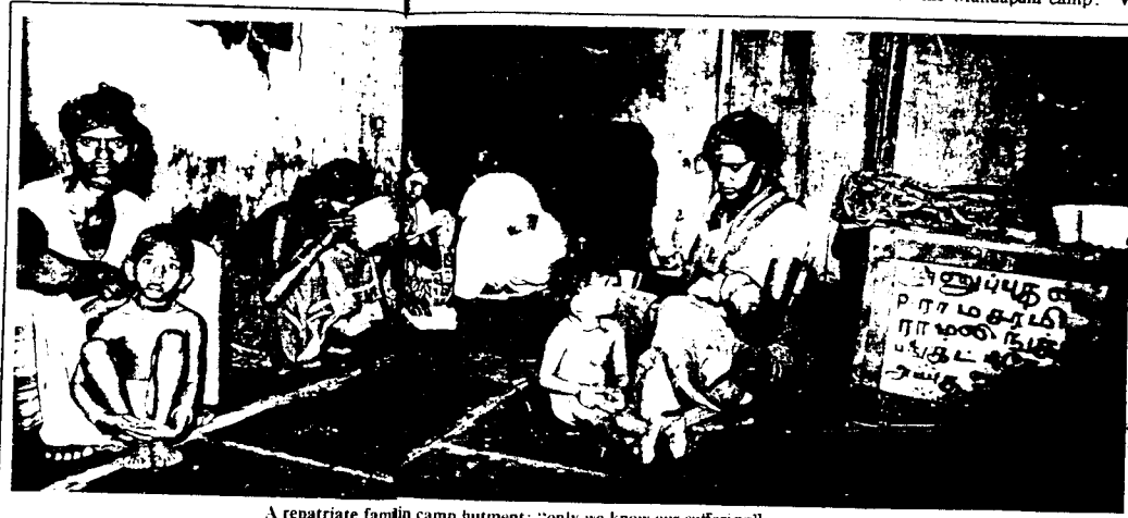
A repatriate familia camp hutment: "only we know our suffering"

The Tamils in Sri Lanka, judging by the Indian Government's reaction, will have to right their own battles. That, in the current tension-filled situation in Sri Lanka, is only likely to push the famils closer to the wall. The present stalemate can only be broken by two alternatives: peaceful compromise through mediation by a third party, like India; or, a violent confrontation that will dismember the island and scar it forever. Tragically the current mood, both in Sri Lanka and New Delhi, favours the latter S. VENKAL NARAYAN in Colombo