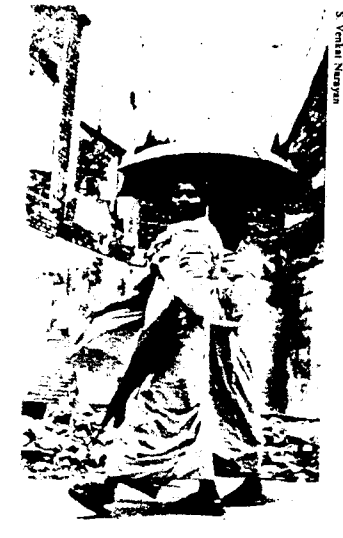
Buddhist monks: political force

In 1972, several Tamil political parties banded together into a single national movement leading to the birth of the refer dedicated to light for Famil rights and political independence. An off-shoot of the IEFF was the more militant youth who ganged together under the Ealam Figers banner, a tightly-knit group that believes in achieving their goal of a Famil homeland through violence. The strength of the Ealam is still unknown. After a series of daring bank robberies and murders of policemen and politicians, the Jayawardene government proscribed the