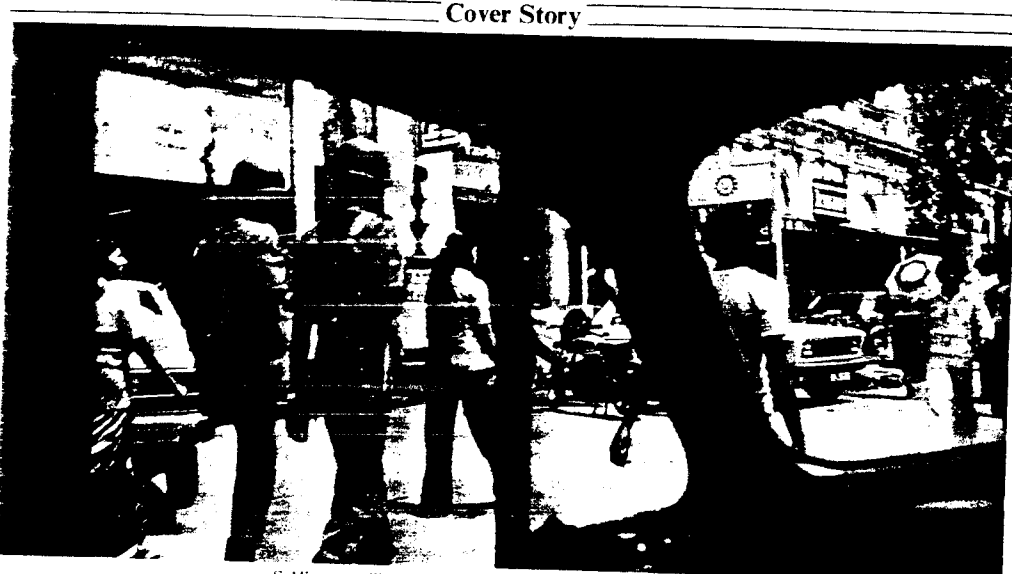
Soldiers patrolling Colombo: an atmosphere of fear and uncertainty