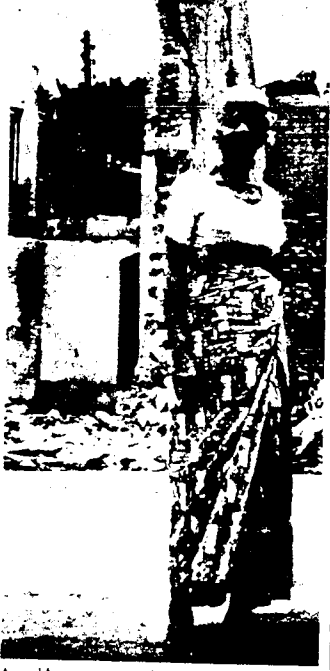
woman stands before her burnt-out house: irretrievable losses

Deep Resentment: In psychological terms, the violence unleashed against the Tamils goes far deeper than surface resentment. The average Sinhalese makes no distinction between Indian Tamils or Sinhalese Tamils. For them, both are aliens. A sadeved Sinhalese bearer at the beautiful Relihui Ova rest house near Balongoda, shook his head sorrowfully and said: "What is the meaning of all this arson and violence? We, the Sinhalese and Tamils, all came from India. We have lived together happily for so