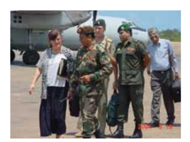
Arrival in Palaly AFB 2001

The rampage had started when Weeratunga landed at Gurunagar in the afternoon of 24 July 1983. Despite that, all the senior members of the army unit in Jaffna were assembled at the helicopter pad of the Gurunagar Camp to receive their commander.