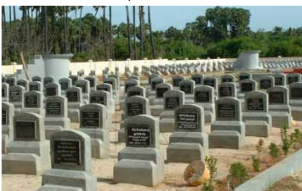
Maveerar Thuyilum Illamgal, Nelliady

That extemporaneous speech gave rise to the tradition of Maveerar Nal Perurai which means Hero's Day Address. The annual address assumed importance and significance over the years, especially in the past few years; it has acquired immense political import. The celebrations, too, expanded from 1990 when, with the departure of the Indian Peace Keeping Force (IPKF) and the start of the Second Eelam War, Jaffna peninsula fell into the hands of the Tigers. From that year to 1994, the observances were held for a week, while from 1995, when LTTE lost the control of the peninsula, they was restricted to three days.